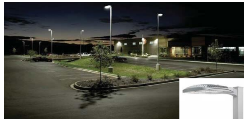
Parking Lot Lighting

Site lighting includes pole-mounted lighting in parking fields, a maximum pole height of 25 feet, and shall be spaced for maximum energy efficiency. All project site lighting shall be of similar design. Lighting should be positioned to maximize lighting at pedestrian crossings and other key intersections to enhance safety and security. Light design should consider off-site lighting, building lighting, and other light sources together. Lighting at the site boundary should be shielded where possible to avoid undesirable impacts to adjacent uses.