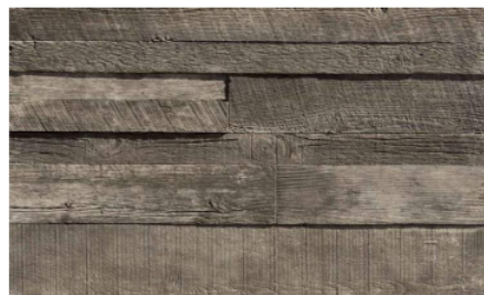
WALL ACCENT/INSET: WOOD LOOK PRECAST VENEER: VINTAGE RANCH PARCHWOOD