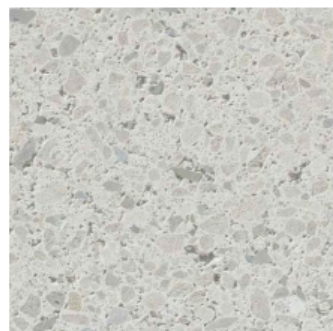
PRECAST BLOCK AND CAPS BASALITE COLOR 205, GROUND FACE, CHAMFERED TOP CAP