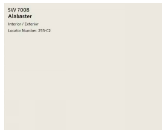
STUCCO WALL BODY FINISH: LACE, COLOR: SHERWIN WILLIAMS SW7008 "ALABASTER"