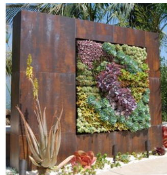
Living Accent Wall